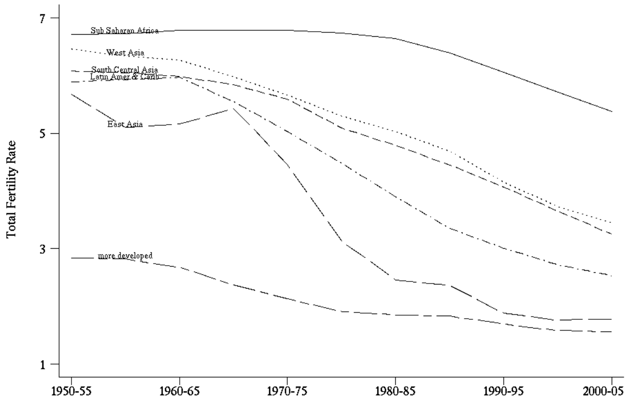
Fig. 2 Total Fertility Rates by Region