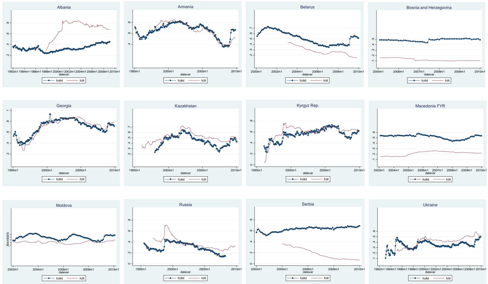
Figure 1a: Financial Dollarization of Non-EU Affiliated Countries