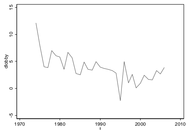
b, Percentage change in lobby groups (smoothed for 1991 and 1992)