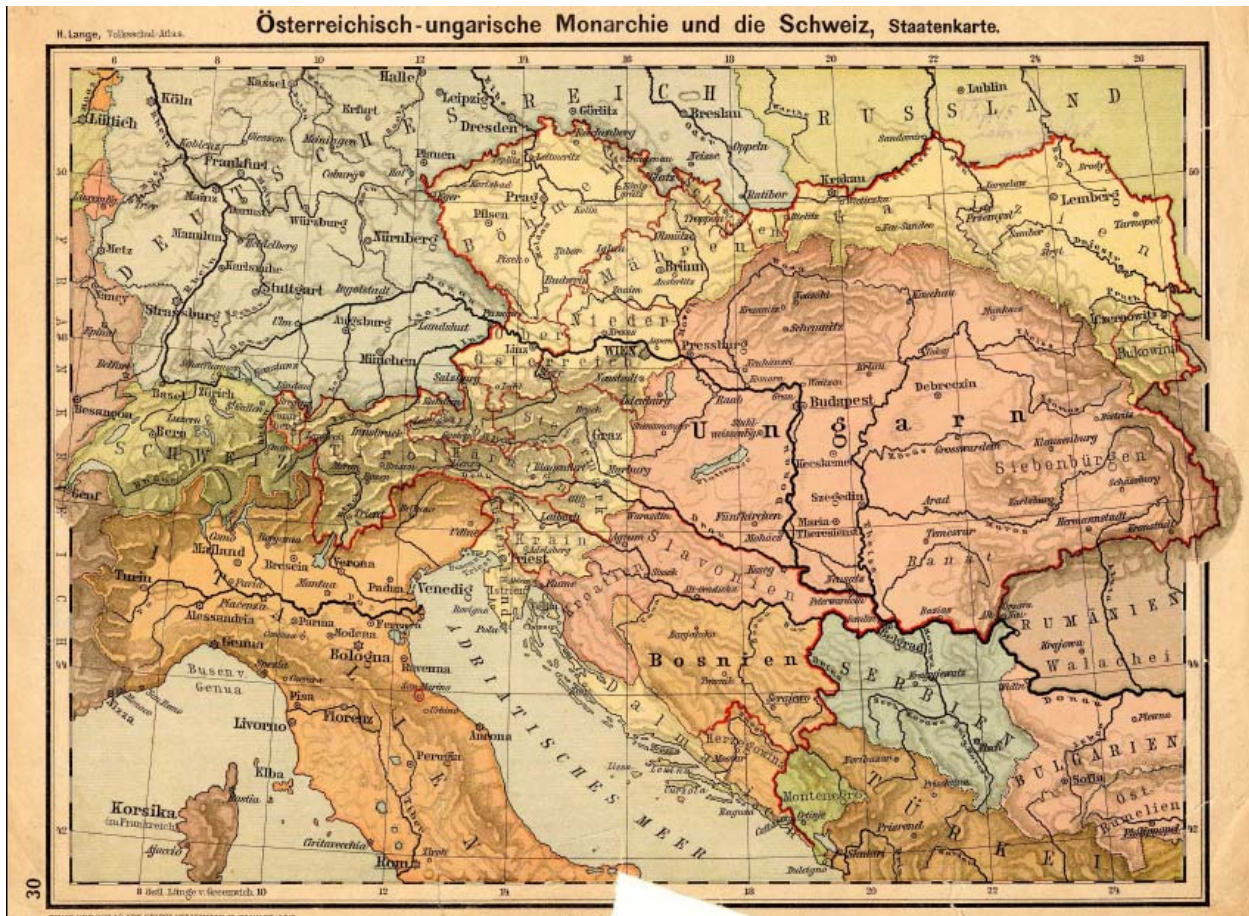
Figure 1: HISTORIC MAP OF THE HABSBURG EMPIRE