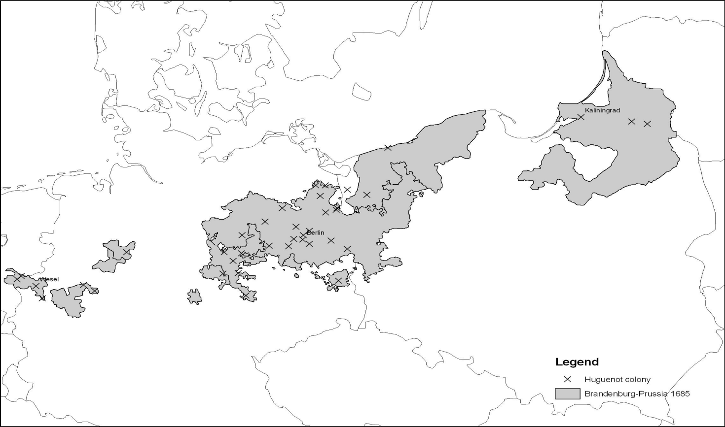
Figure 1: Towns with Huguenot colonies in Prussia, 1685-1795

The Map shows the territory of Brandenburg-Prussia at the time of the Edict of Potsdam in 1685. Urban Huguenot colonies which were founded after 1685 are marked by a cross. Source: Own illustration; see main text for details.