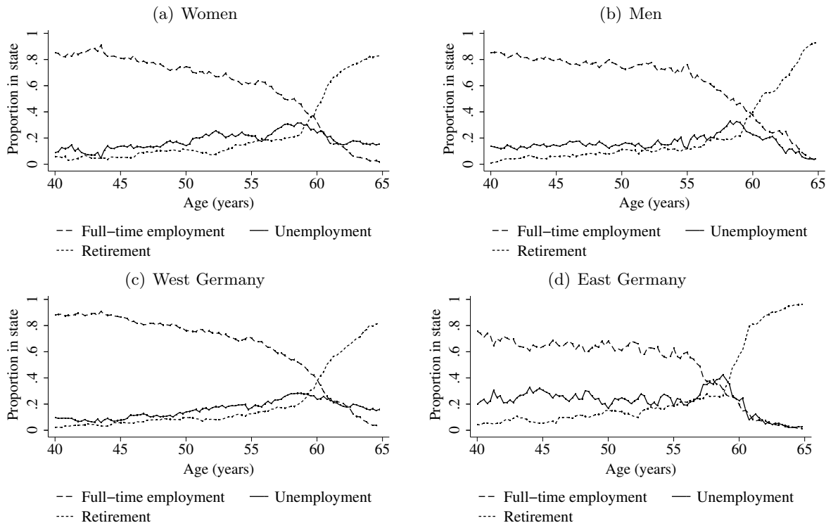
Figure 1: Observed employment and retirement behavior by gender and region of residence

the future income when unemployment insurance runs out as they can make a transition into retirement and receive income from a pension. 22 Unemployment is less attractive for those who are not eligible for early retirement, likely to be younger individuals, as they will be subject to a large drop income if they have not accepted a job before their entitlement to unemployment insurance runs out.