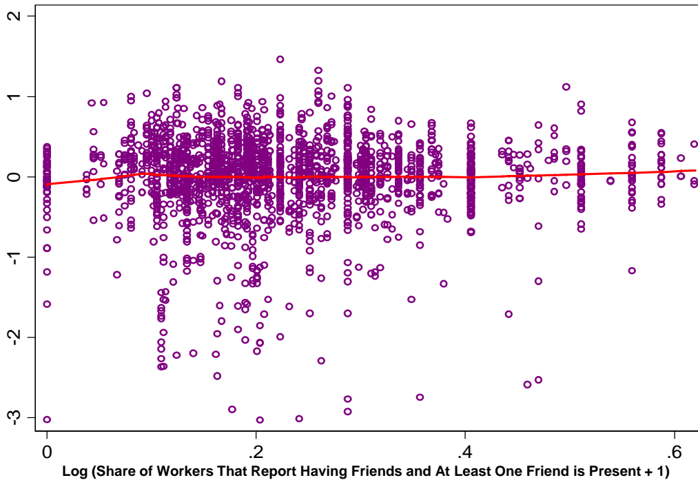
Figure A1b: The Elasticity of Worker Productivity With Respect to the Share of Workers That Report Having Friends and At Least One of Their Friends is Present