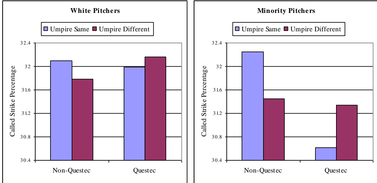
Figure 2: Race and Called Strike Percentage by Game Attendance

This figure graphs the average percentage of called pitches that are strikes in ballparks with and without QuesTec, a system of cameras intended to rate the umpire's performance, for White and non-White pitchers, respectively. For each pair of bars, the bar on the left represents pitches for which the umpire matches the race/ethnicity of the pitcher, while the bar on the right represents pitches for which there is not a match.