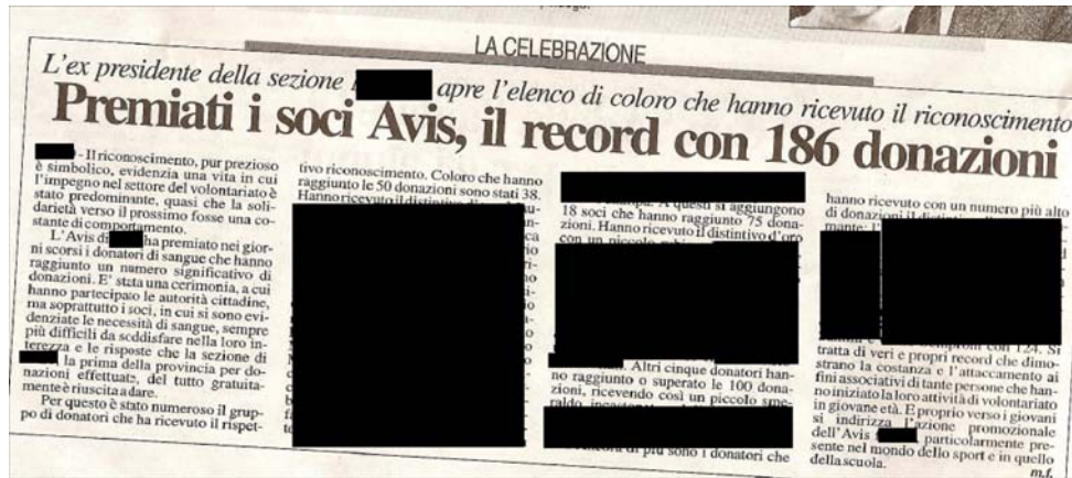
Figure 1: Article from a local newspaper in The Town reporting the names of all donors awarded for reaching 50, 75, and 100 donations, in occasion of the biannual ceremony of the local AVIS Chapter. The name of the town and of the rewarded donors have been redacted for confidentiality reasons.