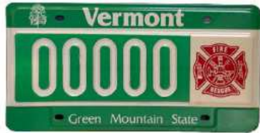
Figure 1: Sample vanity plate