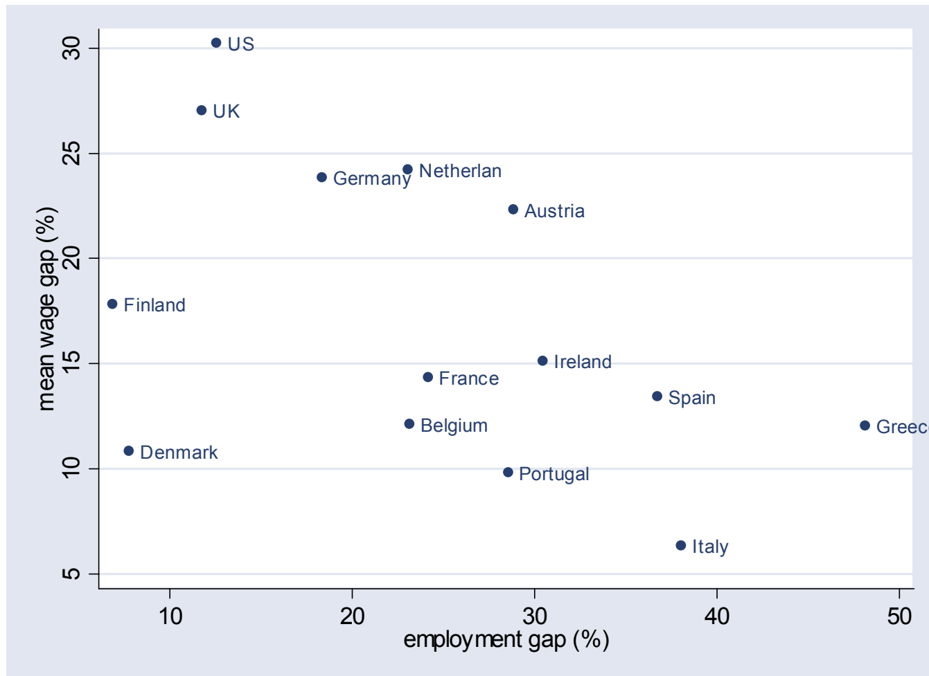
Figure 1: Gender gaps in mean (log) hourly wages and in employment, 1994-2001