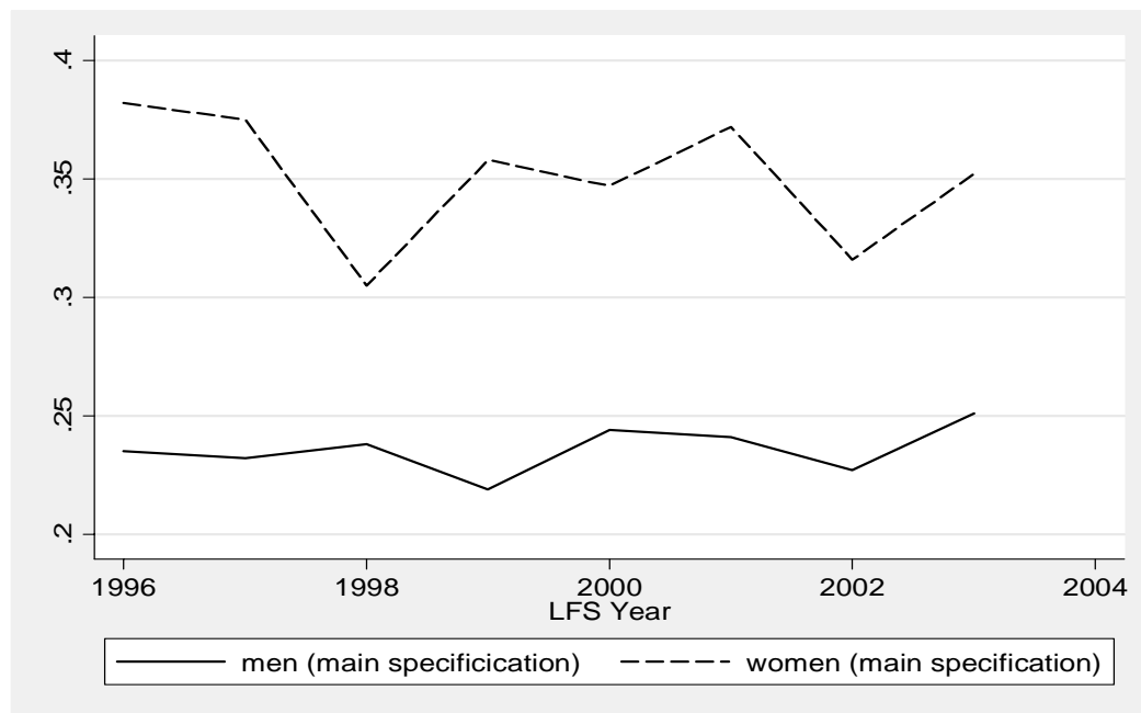
Figure 2 OLS Estimates of College Premium by year: Men and Women

We begin by applying simple linear methods that control for observable characteristics. Figure 2, shows the estimated effect of a degree (on average across all degree subjects) on wages, in each year of the data, making no allowance for differences in cohort but controlling for the amount of work experience, region, marital status, ethnic group, and work limiting disability 13 . We confirm the usual results: that the effect of (typically a three-year) college education on wages is large – the college premium averages around 22% for men and 35% for women. The differences between men and women are highly significant and while there are statistically significant year to year differences they are small on average, and there is no statistically significant time trend for either men or women over this period 14 . These estimates correspond closely to our own earlier research (see Walker and Zhu (2003)) and work elsewhere for the UK (see, for example, McIntosh (2004)) 15 .