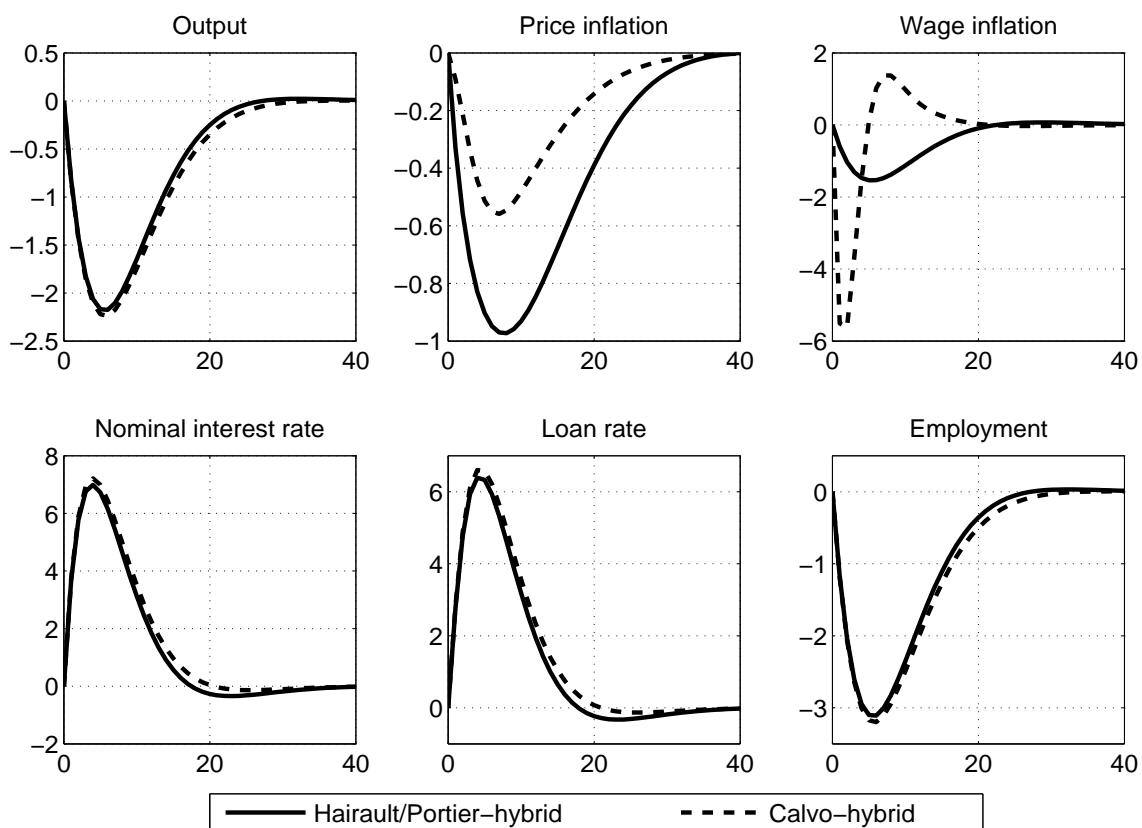
Figure 3: Impulse responses of core variables after a one percent increase of the instrument interest rate under the adjustment cost-extended and the staggered pricing model.