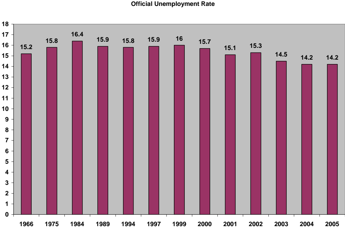
Graph 1: Official Unemployment Rate

with 13.1% debt service ratio). 2 In the last 10 years, Tunisia’s real GDP growth has averaged 5% and inflation has gravitated around 3%. The poverty rate has been brought down from 22% in 1975 to less than 4% by 2001, population growth rate has declined to less than 1% in 2005 (compared to 3% in 1966), and life expectancy has reached 74 years in 2004. The total population stands at 10 million people, with a 3.4 million-person labor force. However, despite an excellent performance in improving socioeconomic and demographic indicators, Tunisia’s unemployment rate remains alarmingly high at 14%.