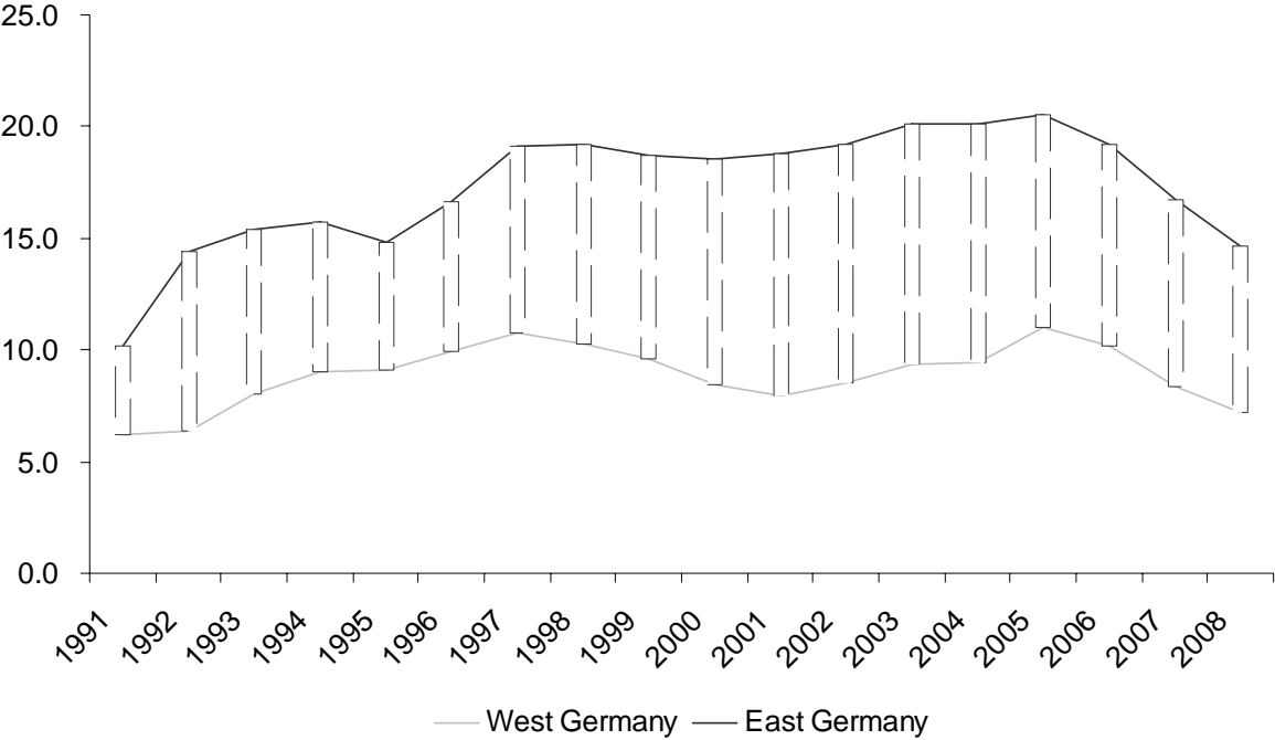
Figure 2: Unemployment Rate in East and West Germany

Notes: The figure shows the development of unemployment rates (in percent) in East and West Germany. Data source: Statistics from the German Federal Employment Agency.