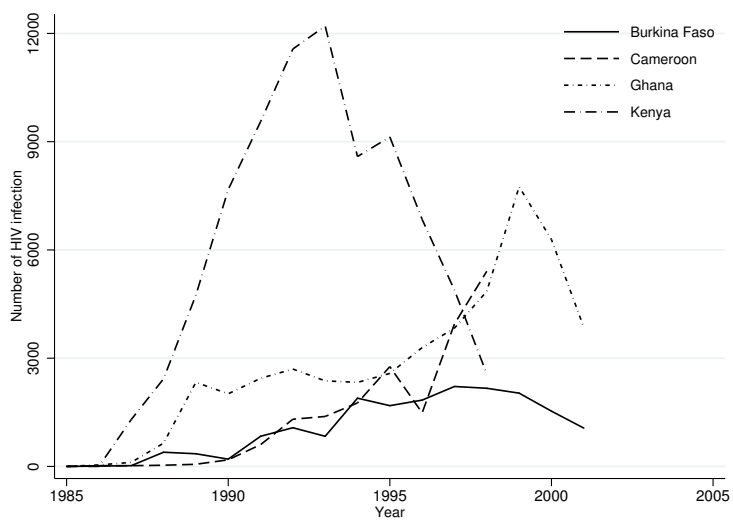
Figure 1 Number of reported AIDS cases by year