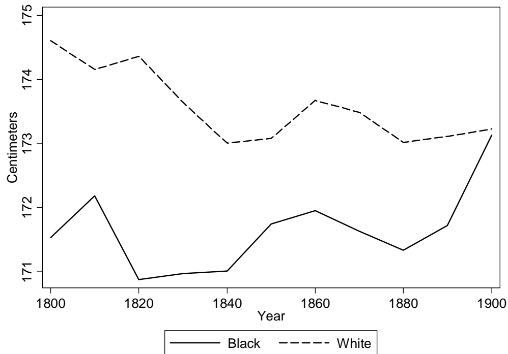
Figure 2, Southern Black-White Stature Comparison

skin, they were less likely to produce sufficient vitamin D and grow as tall as whites (Loomis, 1967, pp. 501-504; Neer, 1979, p. 441).