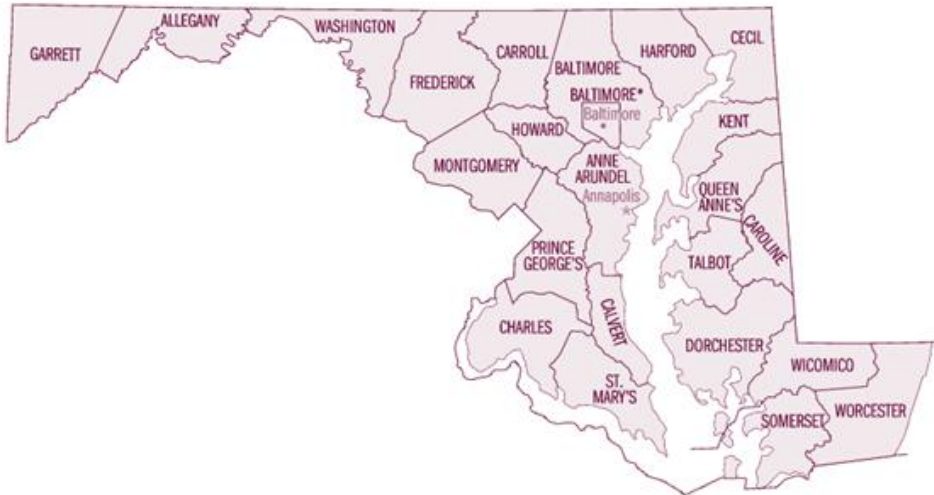
Graph 1 Baltimore MSA: Anne Arundel County, Baltimore City, Baltimore County, Carroll County, Hartford County, Howard County, and Queen Anne's County

The benchmarked Metropolitan Statistical Areas (MSA) and Primary Metropolitan Statistical Areas (PMSA) are: Chicago, IL; Cleveland, OH; Detroit, MI; Milwaukee, WI; Philadelphia, PA; Pittsburgh, PA; and St. Louis, MO. These regions were selected because they fit the old industrial parallelogram and are comparable to Baltimore.