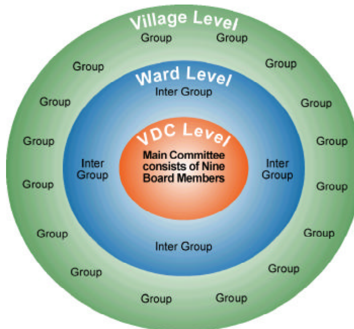
Figure 1: Small Farmer Group Building on Different Levels:

In detail, the management of SFCLs consists of the Institutional Manager, who is at the same time secretary to the board of directors called the Main Committee (MC). He takes part in the MC-meetings, yet does not have voting rights. He is assisted and replaced during his absence by the Assistant Manager, who frequently is in charge of specific tasks like running the Banking Unit or forming new groups. Another professional is the Accounting Assistant. The above listed staff members must have at least attained an SLC (School Leaving Certificate), i.e. need to have successfully passed grade 10 in school. The Institutional Manager, in addition, should have some years of working experience in the Sub Project Office/SFCL and has to be from the respective Village Development Council (VDC, the local administrative unit) to ensure local knowledge and stricter social control. 5