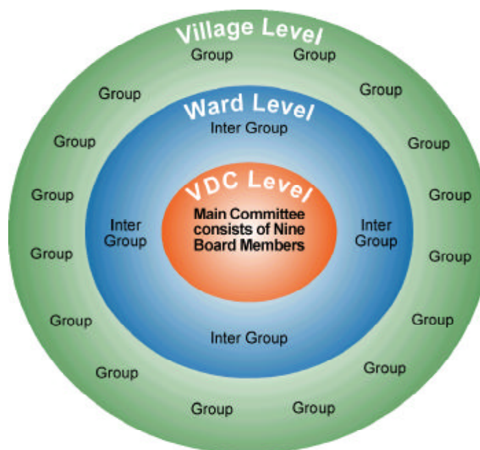
Figure 1: Small Farmer Group Building on Different Levels:

In detail, the management of SFCLs consists of the Institutional Manager, who is at the same time secretary to the board of directors called the Main Committee (MC). He takes part in the MC-meetings, yet does not have voting rights. He is assisted and replaced during his absence by the Assistant Manager, who frequently is in charge of specific tasks like running the Banking Unit or forming new groups. Another professional is the Accounting Assistant. The above listed staff members must have at least attained an SLC (School Leaving Certificate), i.e. need to have successfully passed grade 10 in school. The Institutional Manager, in addition, should have some years of working experience in the Sub Project Office/SFCL and has to be from the respective Village Development Council (VDC, the local administrative unit) to ensure local knowledge and stricter social control. 5