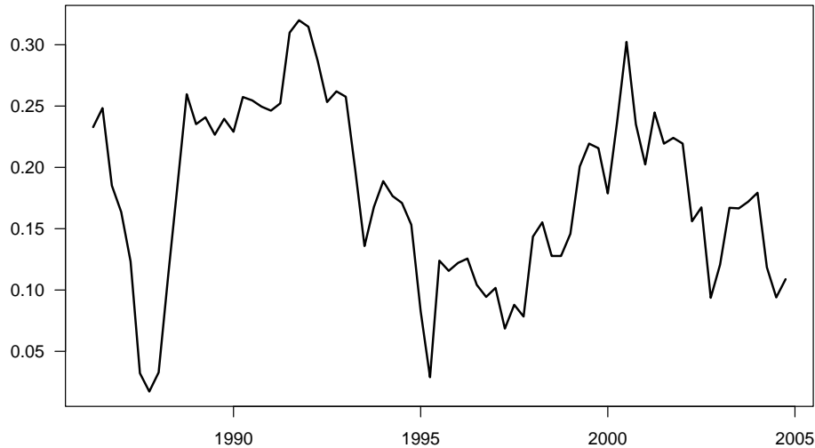
Figure 5.3: Quarterly (log) real bilateral exchange rate of the Australian and New Zealand Dollar.

powerful than the ones based on t -ratios (Phillips and Xiao 1998).