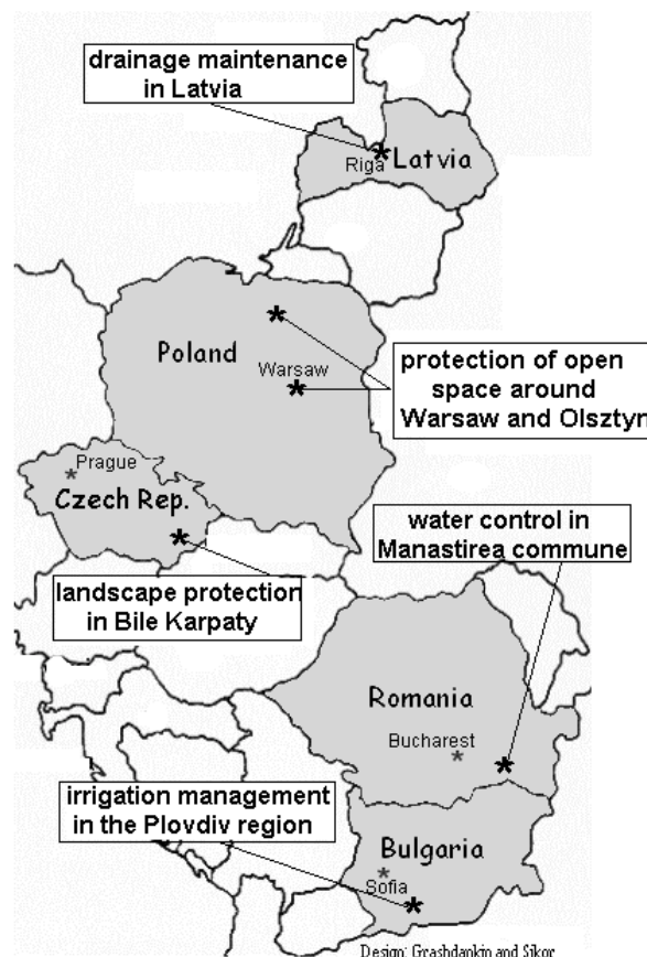
Figure 2: The case studies in Central and Eastern Europe

The current situation is radically different from that under socialist agriculture. Large state farms and co-operatives dominated agricultural production in the case study sites, with the exception of the Polish sites. Large state bureaucracies were the tools for a strongly hierarchical approach to natural resource management, combined with some elements of local-level co-operation in water management. Technical agencies were responsible for the provision of water, construction and maintenance of irrigation and drainage infrastructure, soil conservation programs, urban and regional planning, and the protection of biodiversity. Postsocialist reforms radically altered the institutional framework for the management of common-pool resources as well as rural actor constellations. How agrarian transformations affected the management and state of common-pool resources is the topic of the ensuing analysis.