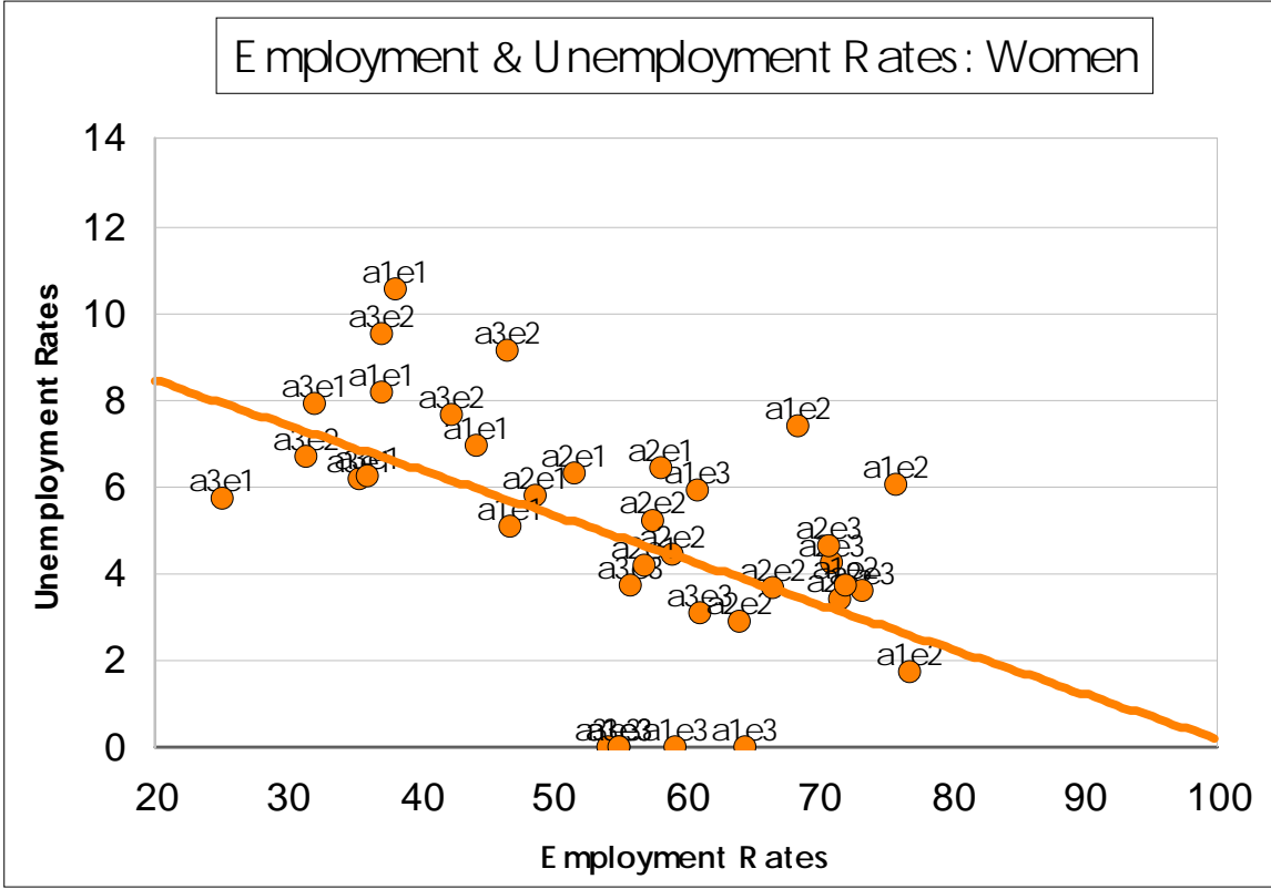
Figure 2: Employment vs. Unemployment Rates Across Demographic Groups