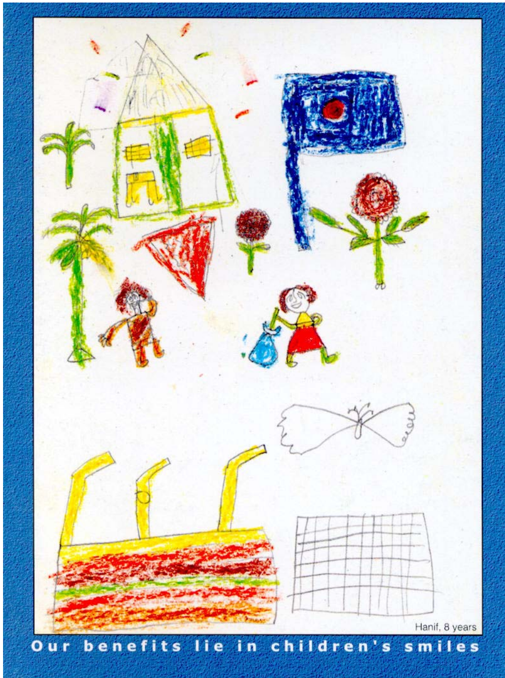
Appendix: An example of the included postcards