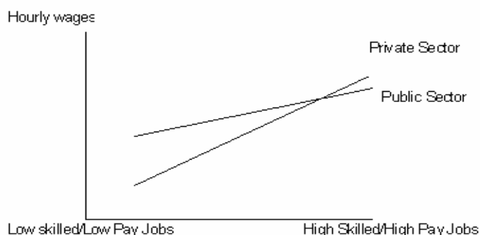
Figure 1 – Pay profiles by skill: Public and private sectors

There are of course several features that are missing from a simple wage comparison which might be relevant. For example, other dimensions of the work package and the work environment such as job security, risk and injury at work, may play a role (Hamermesh and Wolfe, 1990; Sandy and Elliott, 1996). Also, workers might be heterogeneous across sectors with respect to some unmeasured characteristics in a non random way, such as preference for public sector work, desire to be a civil servant, or work in the non-profit sector, and self-select themselves according those features. In this paper, while acknowledging the caveats that the features discussed above may imply, we restrict attention to the public sector pay gap as measured by hourly wages and focus on pay differentials between the public and the private sector that emerge along the entire wage distribution. The next section briefly reviews the empirical evidence and discusses the main results from previous studies.