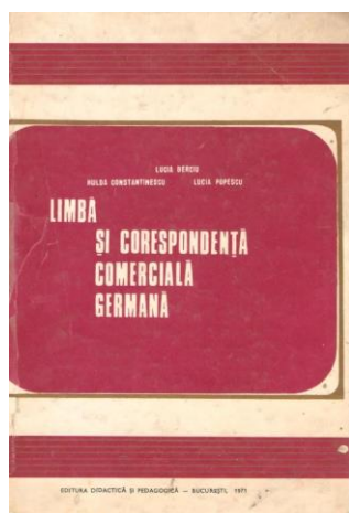
German Commercial Correspondance Manual, 1971