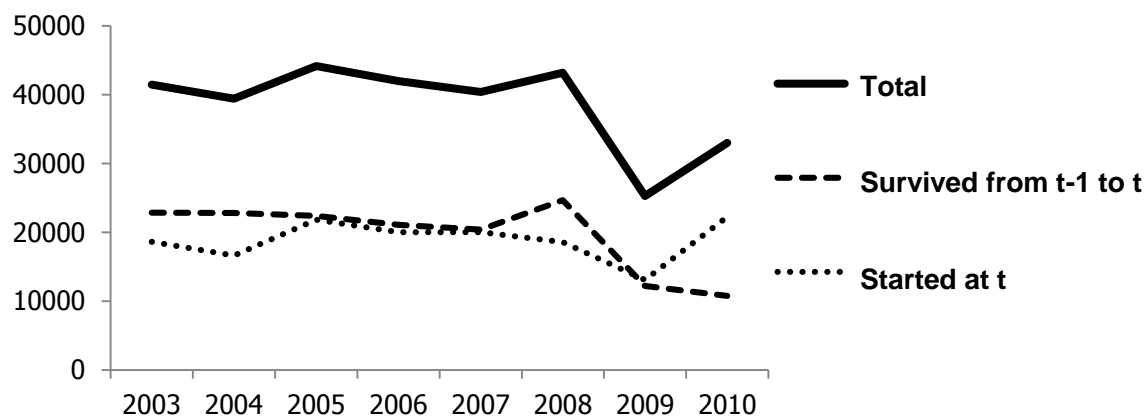
Figure 3. Export flows dynamics in Russian regions, 2003-2010

In order to analyze the factors of export survival we use a semi-parametric approach of risk assessment proposed by Cox (Cox, 1972) and employ the following basic specification: